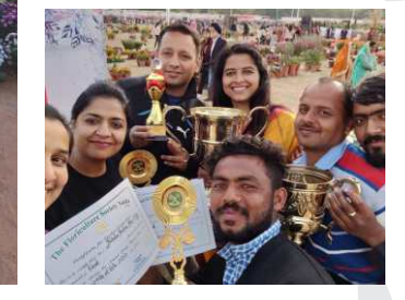
Best Landscape award by Adobe in 2017 & 2018