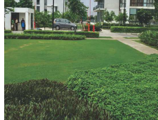
Adobe 132 (Corporate)