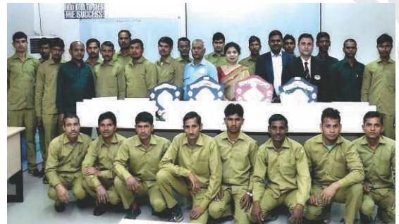
Best Landscape Maintenance Award by ITC Mughal, Agra, 2015